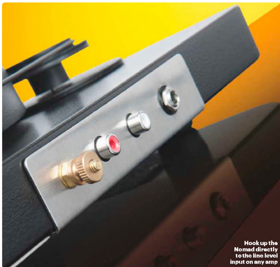
Hook up the Nomad directly to the line level input on any amp

stainless steel rod through the gimballed/yoke bearing. At 10in, it's longer than most 'standard' 9in arms in an effort to reduce tracking distortion. Unlike other VPI arms, the Nomad's doesn't rely on a loop of exposed arm wires for anti-skate, which adds to its simple lines and fuss-free user experience.